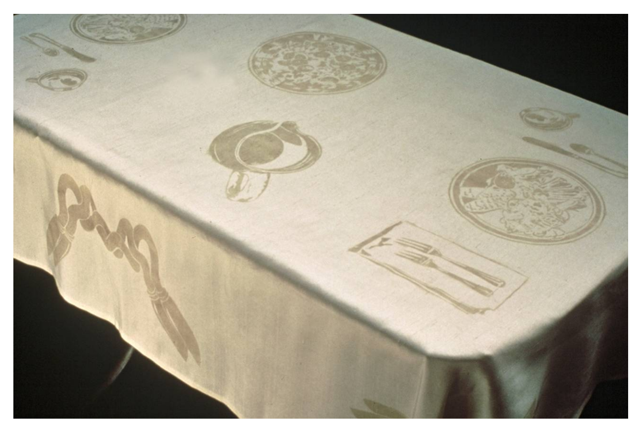
Kim Abeles Give Us This Day, 1993 Smog (particulate matter) on linen tablecloth